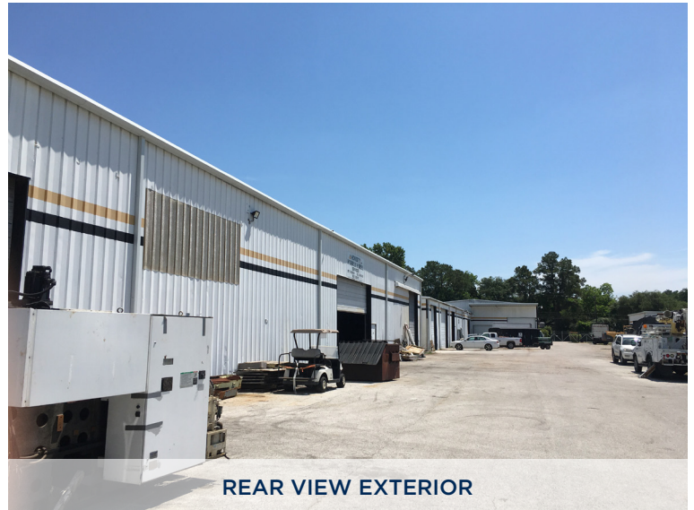
REAR VIEW EXTERIOR