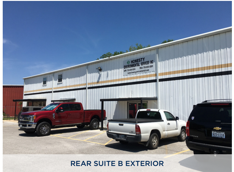
REAR SUITE B EXTERIOR